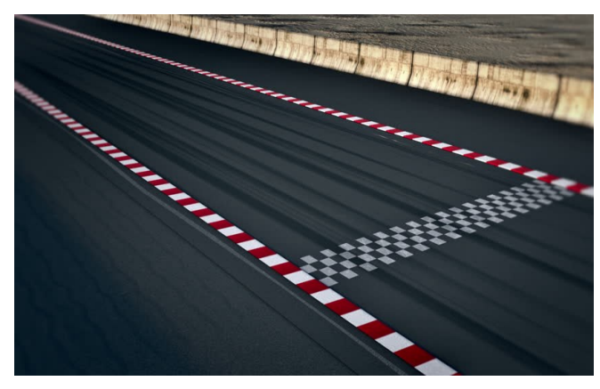
Place must be fixed

The word 'through' in Article 5 of DTAA ( dealing with PE ) demonstrated that the place of business qualifies only if 'it is at the disposal' of the enterprise. The enterprise would be able to use it as instrument for carrying on its business only if such place is under the control of the enterprise to a considerable extent. The modalities and intensity of control will depend on the nature of business activity being carried by a taxpayer. However, if the presence or control over a place is limited or transitory, such place would not qualify as place at the disposal of the enterprise.